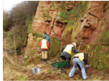
Clearing and maintaining sites