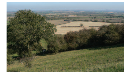
Burton Dassett Hills Country Park