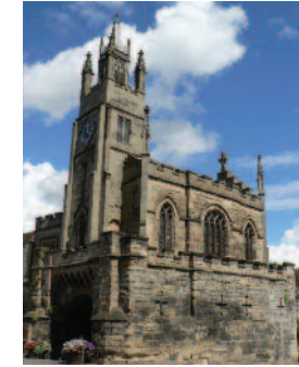
Rocks used for building stones

Aggregate crushing plant: Mancetter quarry Rocks exploited as economic resources