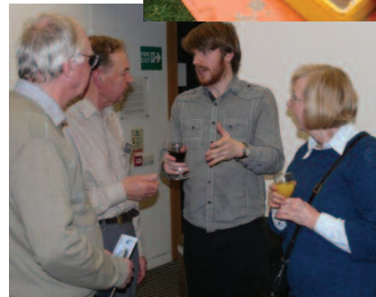
Supporting young geologists through the Holloway Bursaries