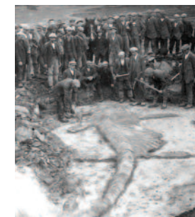
Warwick County Museum

Rocks and fossils can be seen in museums and their collections