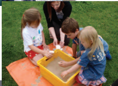
Working with children